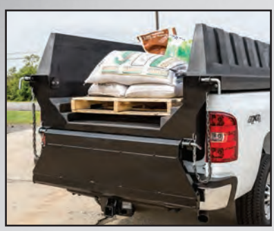
New design accommodates standard pallet