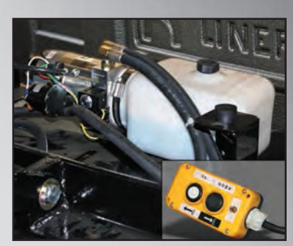
Power up & power down Monarch power unit with 10' tethered control box