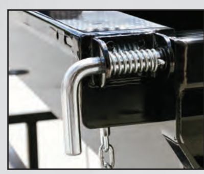
3/4" Diameter tailgate hitch pins