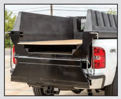
New design accommodates full sheets of plywood