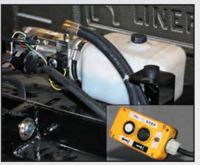
Power up & power down Monarch power unit with 10' tethered control box