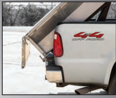
Double pivoting & removable tailgate