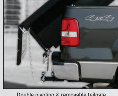
Double pivoting & removable tailgate