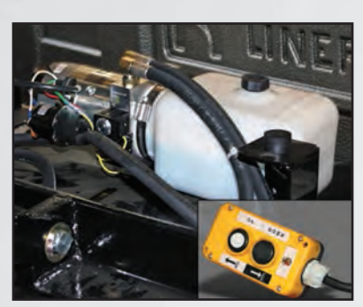
Power up & power down Monarch power unit with 10' tethered control box