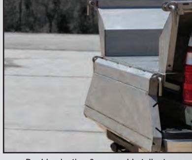
Double pivoting & removable tailgate