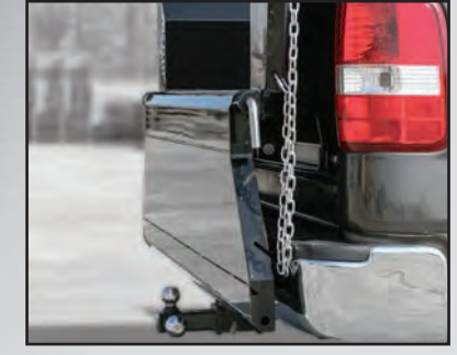
Double pivoting & removable tailgate